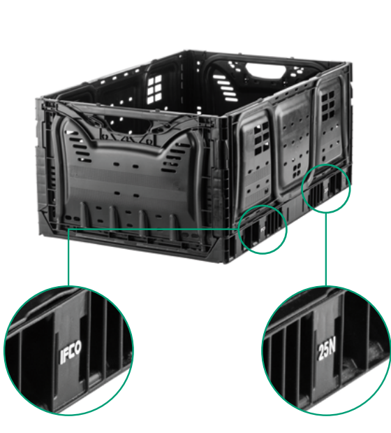
IFCO Logo Stamp Embossed

IFCO marks its proprietary containers with distinctive markings. This includes the IFCO stamp in white ink, along with the size of the container. There may also be labels on the side of the container.